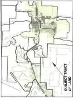
VICINITY MAP (no scale)