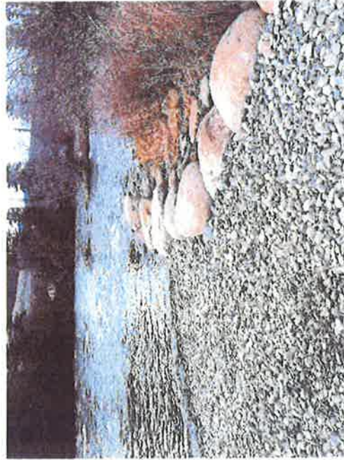
BOAT RAMP CONCEPT SAMPLE PHOTO