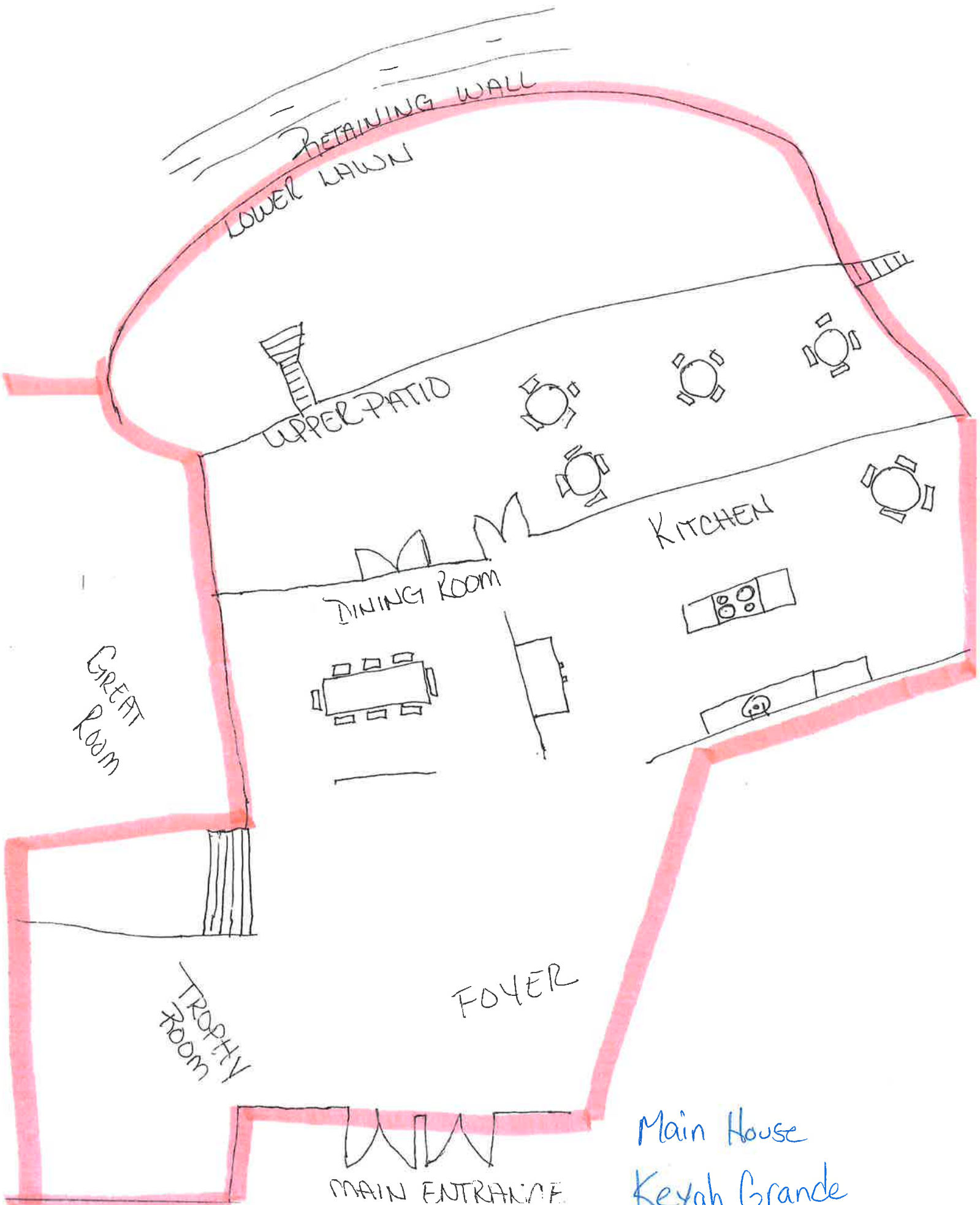
Main House Keyah Grande